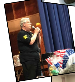
More than 300 attendees